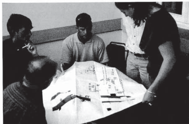
Fig. 1.2. Rome 2007, discussion group on cesspits and sewers.

Since the authors of the following chapters are international (they come to the topic at hand from the perspective of different training and different scholarly traditions), we editors realized that we would have to make a number of choices about the style, formatting, spelling, and terminology used throughout the book. We decided to standardize these points as much as possible to eliminate confusions and inconsistencies. We have used American (as opposed to British) spelling. In Latin spelling, we have used 'v' for 'w' sounds, for example privatus as opposed to priuatus . All dates appear with BC or AD. We understand multi-seat toilets accessible in public areas as 'public' toilets. These can also be called 'latrines'. Smaller toilets (with one, two, or a few seats in them) accessible from within private properties are called 'private'. These matters can be compli-