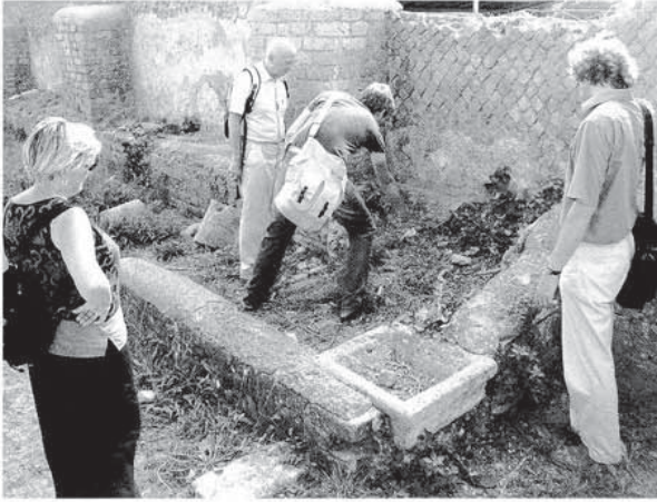
Fig. 1.4. Ostia 2007, discussion group during field trip.

analyses of whatever problems they were treating, as opposed to purely descriptive points of view. With this in mind, in several of the following chapters and sections of chapters, we approved case studies to accompany the more general analytical narratives to strengthen arguments with detailed excavation reports or research results. We think these case studies offer exciting avenues for future research efforts to be intensified.