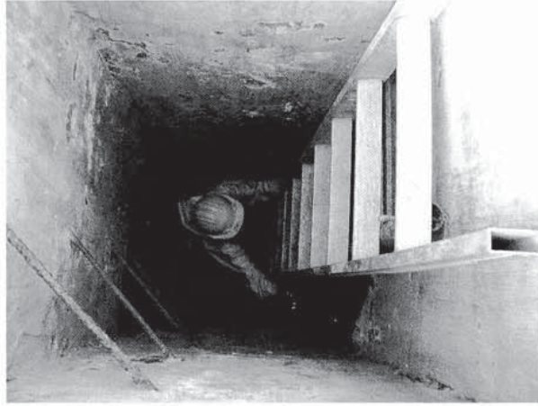
Fig. 1.5. Rome 2007, entering the Cloaca Maxima.

We know that we have not covered all possible topics related to toilets in this book. Astute readers will notice, no doubt, many omissions: the famous Knossos toilet system; Bronze Age precursors to toilets of the Hellenistic and Roman periods; discussion of ancient medical and philosophical texts that deal with faeces and urine; treatment of late antique and Byzantine toilets. Still, we ask our readers to hold on to your seats (excuse the pun) for a reading adventure that will overturn many well-established ideas. For example, the notion that visiting a toilet was a social event or that the sponge tied to a stick and used for cleaning was the only cleaning device available